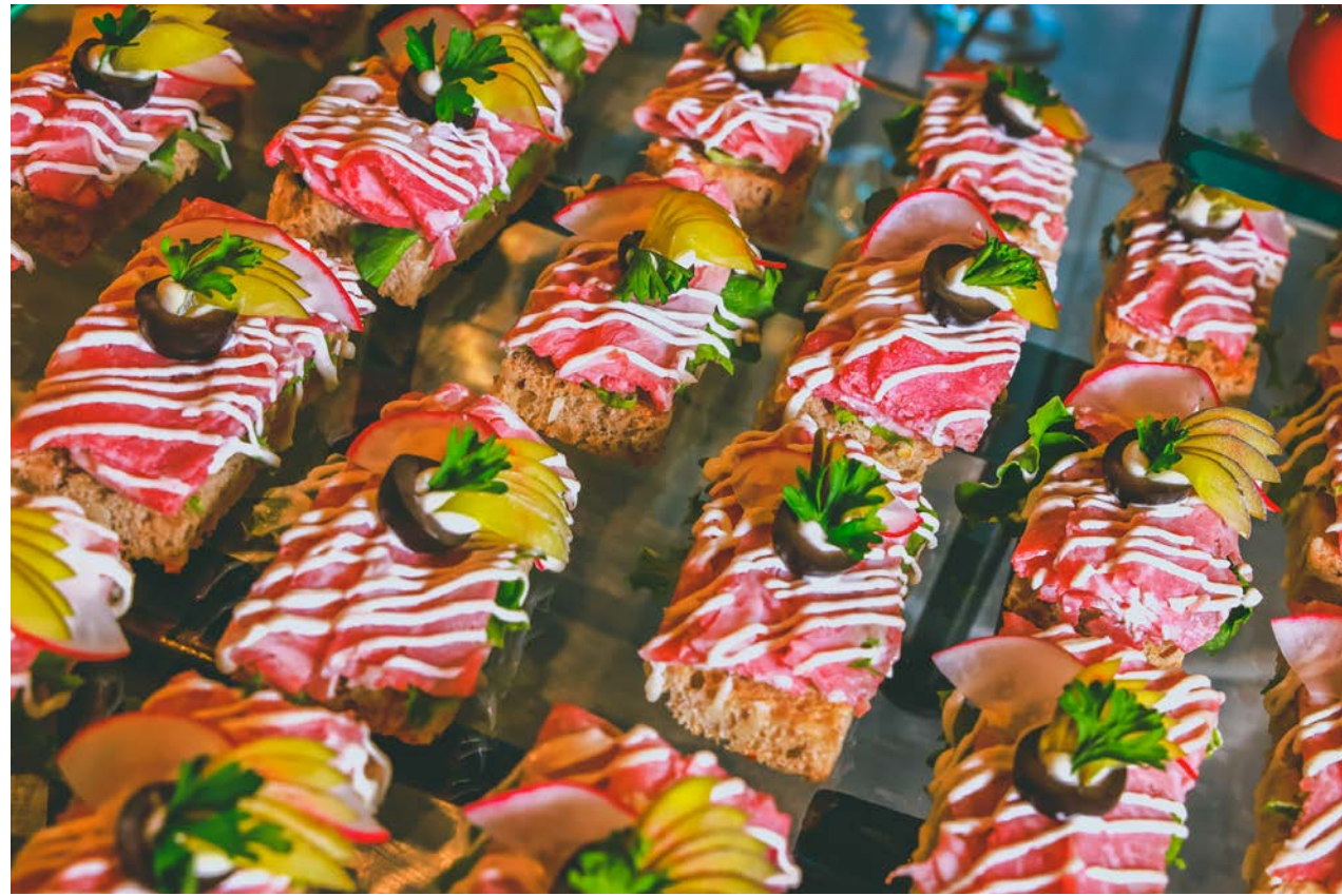
COLD - CHOOSE 4

Receptions are 1 hour with the option to extend in \frac{1}{2} hour increments a la carte; Weddings are 1 hour and 30 minutes on embarkation day; All extended receptions purchased a la carte are subject to venue availability.