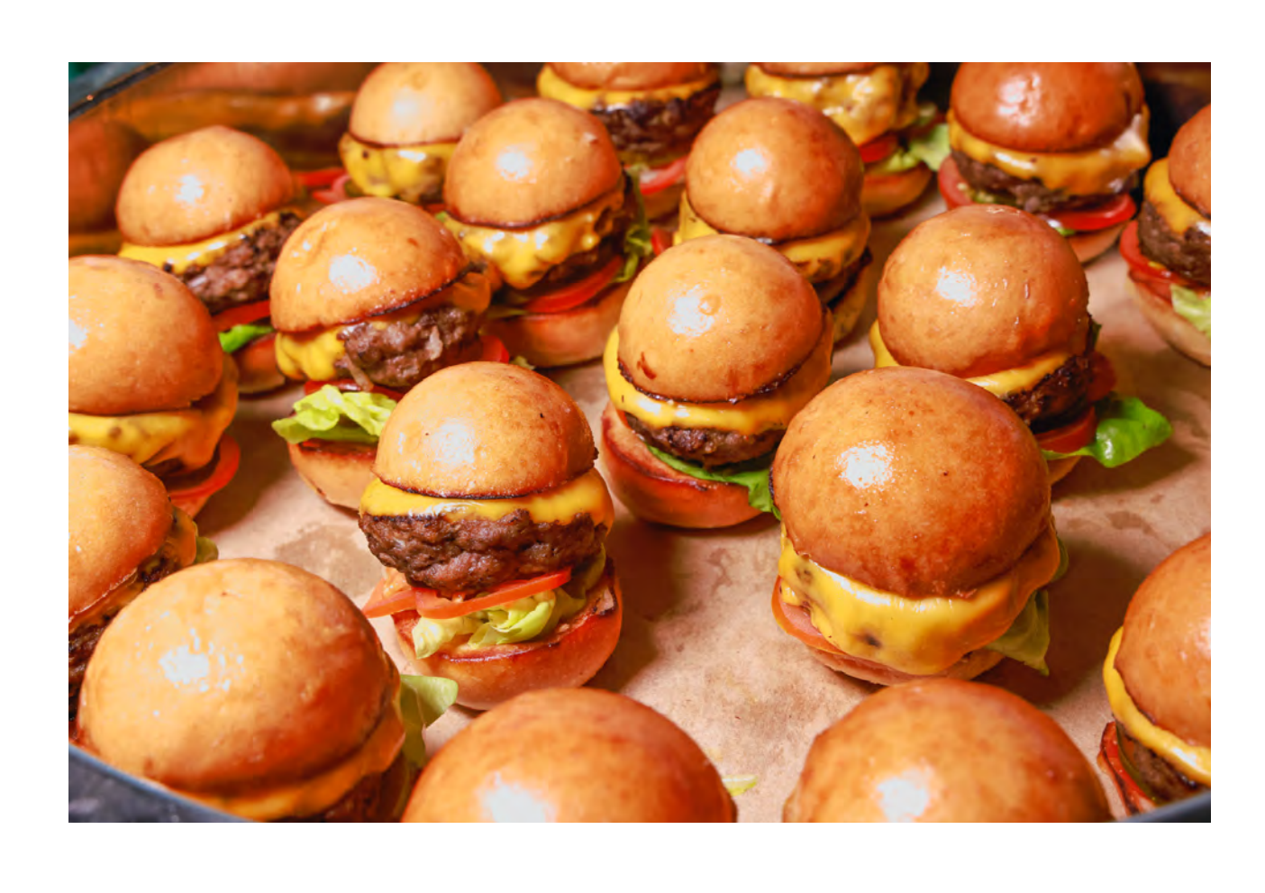
HOT - CHOOSE 4

Cherry Tomato with Fresh Mozzarella (V) (G) Roast beef with Horseradish Cream (G) Marinated Scallops in Rice Paper Shrimp Rolls in Crispy Philo (D) Yellow Tail Snapper with Cilantro Jelly or Wonton Skin (D) Lobster Roll in Butter Bun